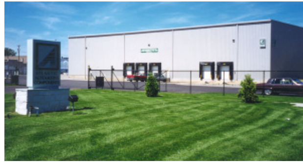
Significant work was done to acquire deteriorated properties, remove them, and construct a new location for Atlantic Automotive Components . Ox Creek was even rerouted as a part of the project all in a 6-month timeframe.