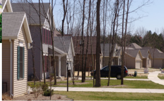
Located in Benton Charter Township, once underutilized land the Elisha Gray Enterprise Park is now home to several businesses and a very diverse housing subdivision.