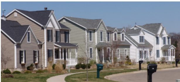
The Edgewater Development site is a 422-acre area. The Edgewater Development Plan site is a cooperative project between the City of St. Joseph, the City of Benton Harbor, Whirlpool Corporation, and Cornerstone Alliance. The area has been redeveloped to include business and housing.